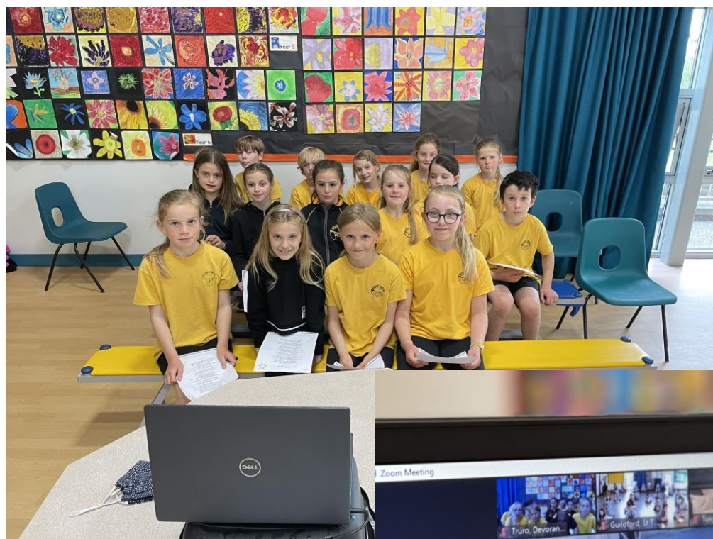
Some of our Y5 children at the G7 Mega Zoom singing Gee Seven