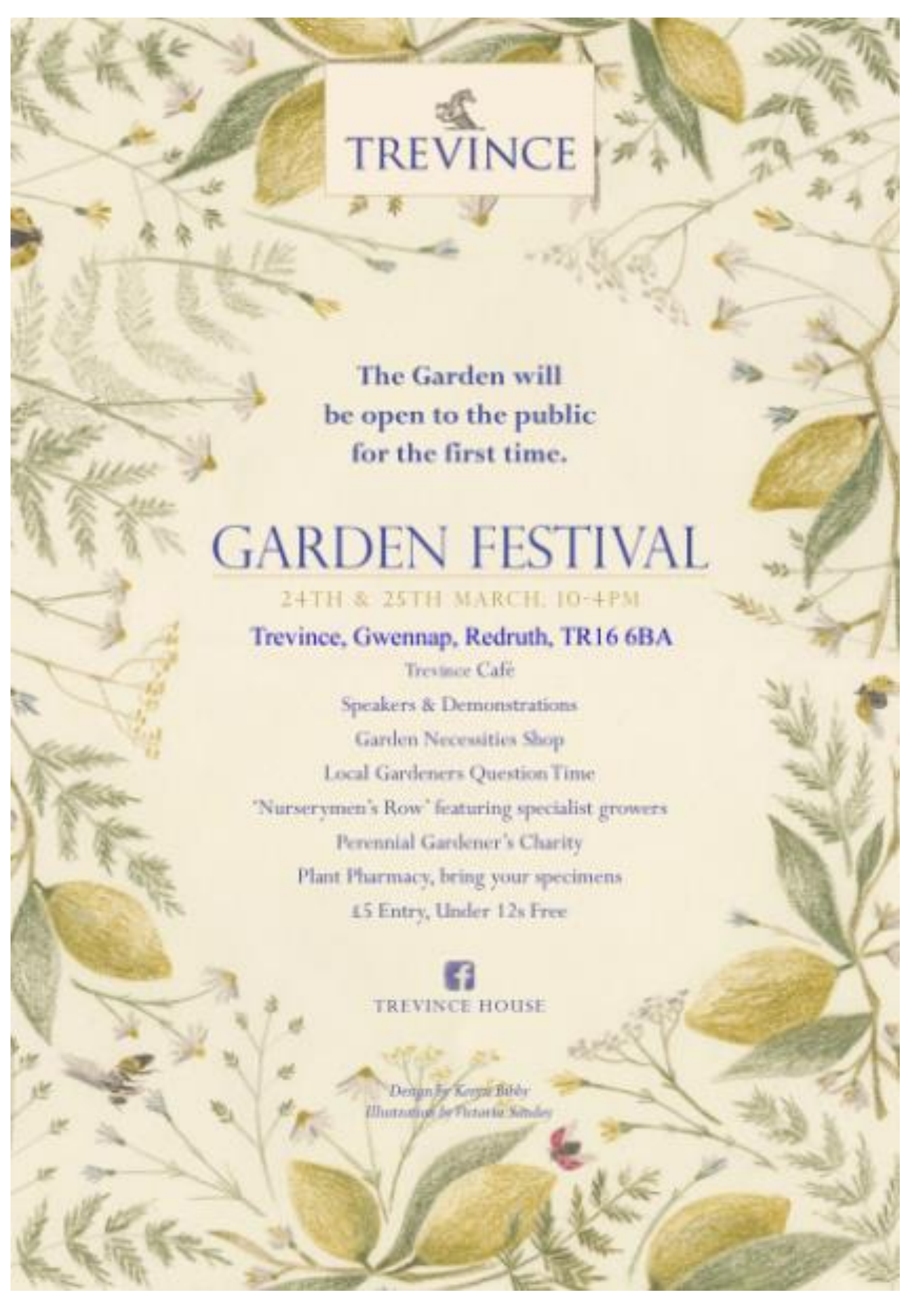
Whilst we are happy to promote events in our local community, Devoran School does not in any way endorse or take responsibility for any of these events.